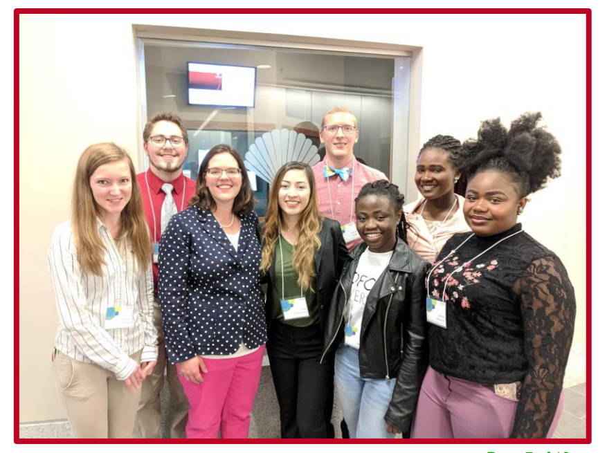
Page 7 of 18