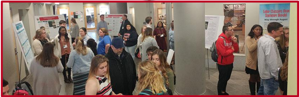
Page 10 of 18