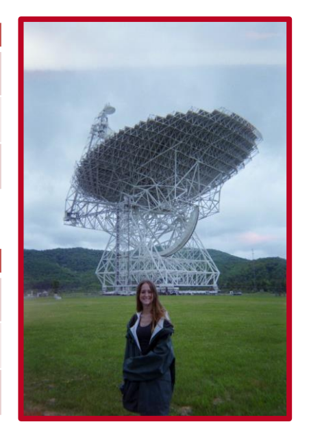
Page 12 of 18