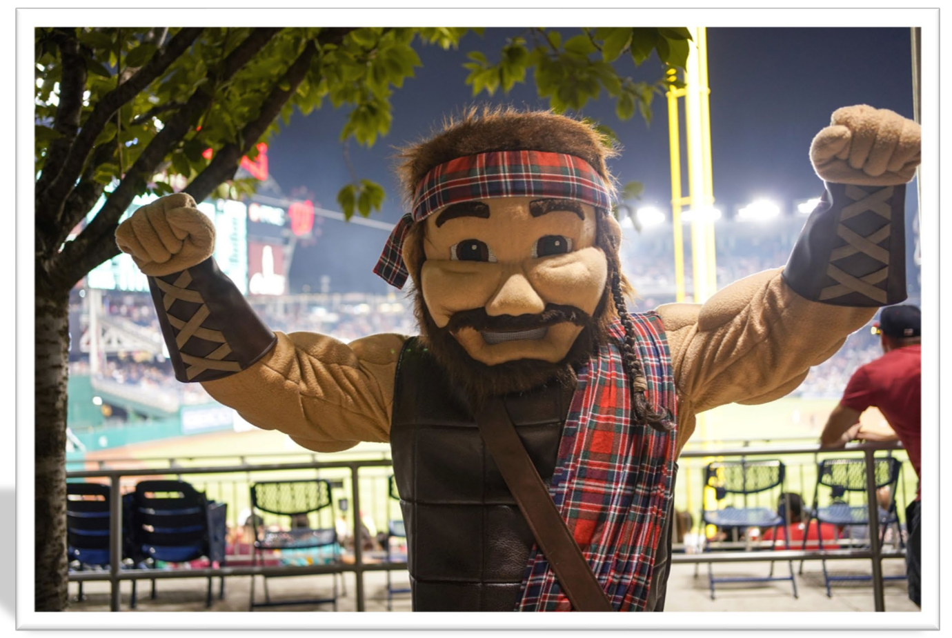
Page 7 of 31