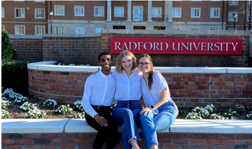
Student Government Association President