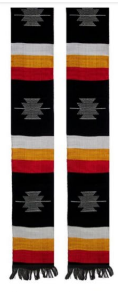
Native American Stole