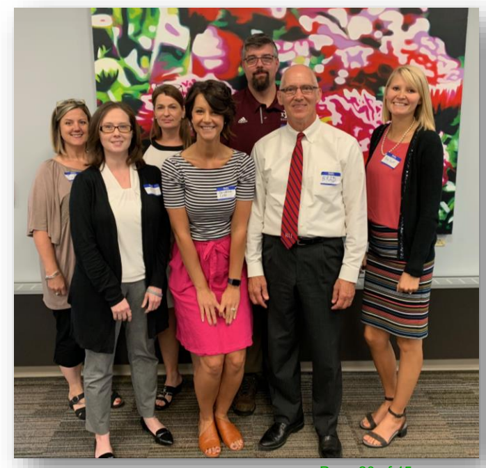
Page 20 of 45