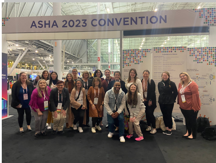
COSD alumni met up with current faculty and students at the expo center in Boston during the ASHA convention. It was wonderful to see everyone!!